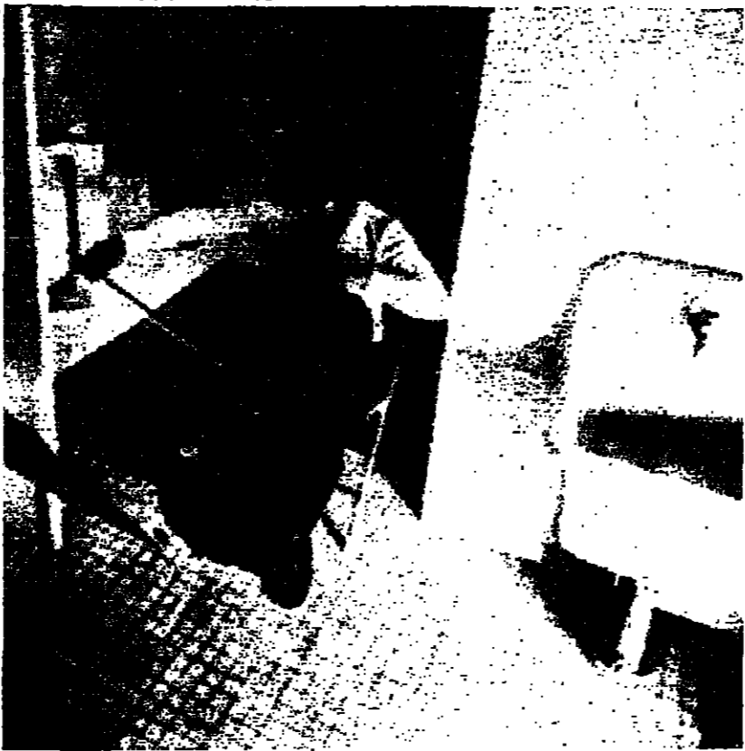
A cellist of the Japan Philharmonic Orchestra photographed during practice in an unlit lavatory after his training hall was closed and the electricity was cut off this week following the dissolution of the orchestra. The orchestra was officially disbanded last June because of financial problems with its sponsors. The Musicians Union is taking the matter to court. But meanwhile orchestra members are trying to stay together and practise where they can.